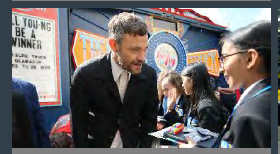
LGBT+ Reading Roadshow